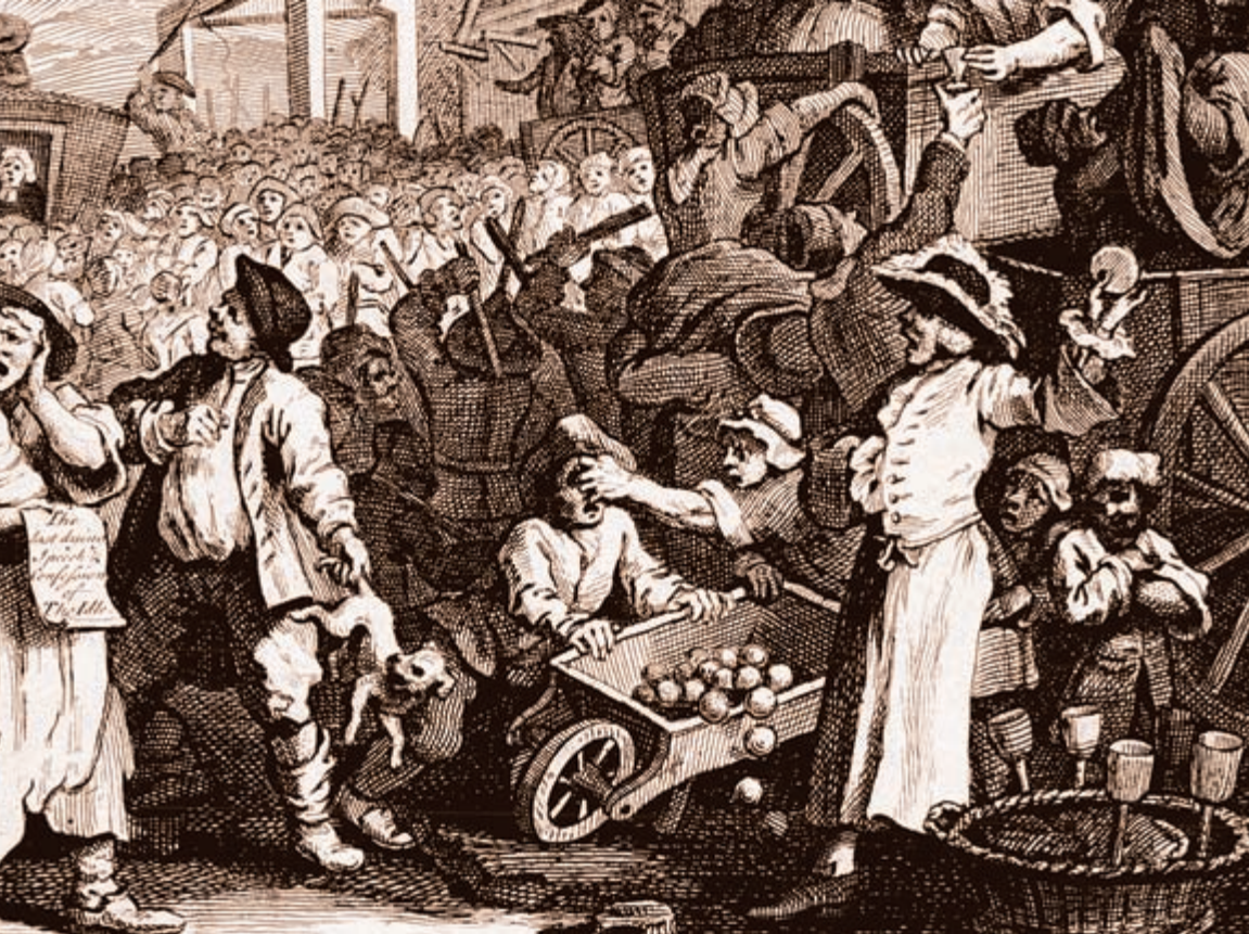
The Idle Prentice Executed at Tyburn , William Hogarth. Plate XI of Industry and Idleness , 1833. Engraving.

frequent experience that their flesh was generally tough and lean, like that of our schoolboys, by continual exercise, and their taste disagreeable; and to fatten them would not answer the charge. Then as to the females, it would, I think with humble submission, be a loss to the public, because they soon would become breeders themselves; and besides, it is not improbable that some scrupulous people 120 might be apt to censure such a practice (although indeed very unjustly) as a little bordering upon cruelty; which, I confess, hath always been with me the strongest objection against any project, how well soever intended. E