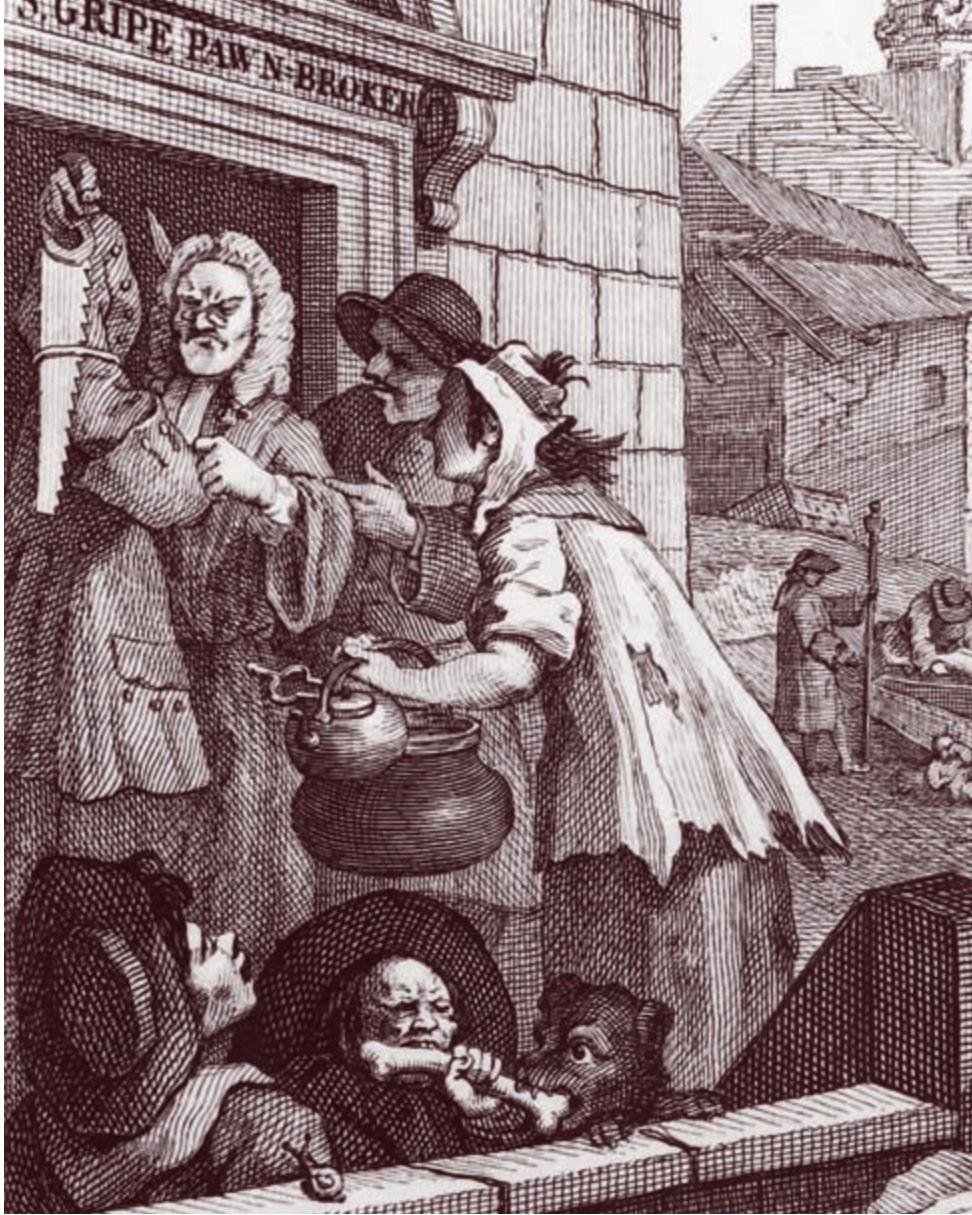
Detail of Gin Lane (1700s), William Hogarth. Engraving.

mercy toward their tenants: lastly, of putting a spirit of honesty, industry, and skill into our shopkeepers; who, if a resolution could now be taken to buy only our native goods, would immediately unite to cheat and exact upon us in the price, the measure, and the goodness, nor could ever yet be brought to make one fair proposal of just dealing, though often and earnestly invited to it. 1